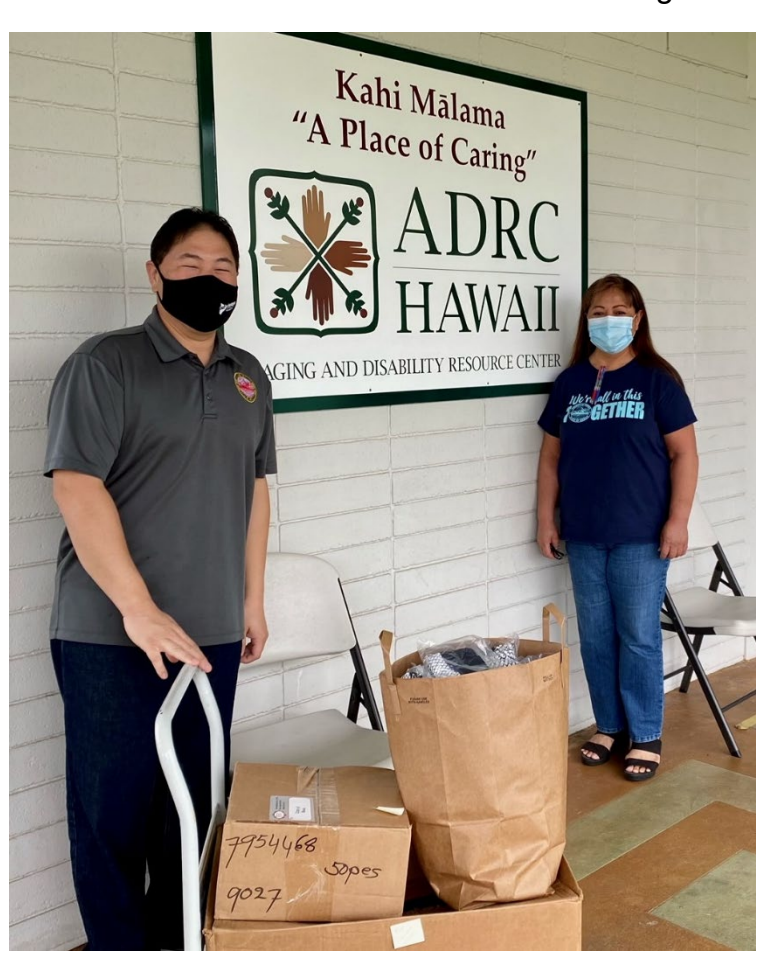
HCOA Staff help prepare materials for Papaikou Health Fair