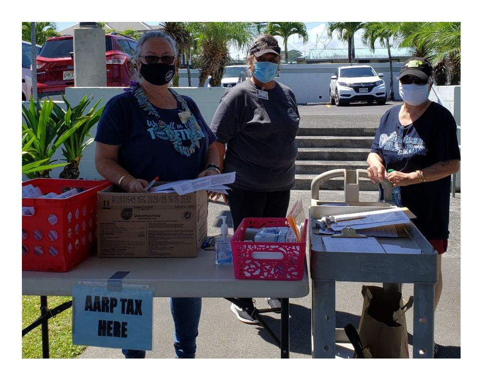
CSE Staff and AARP Volunteer at the drive through station.